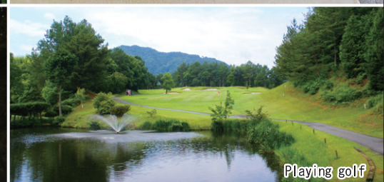
Iya Kazura Bridge Traditional soba making experience Traditional soba making experience Playing golf